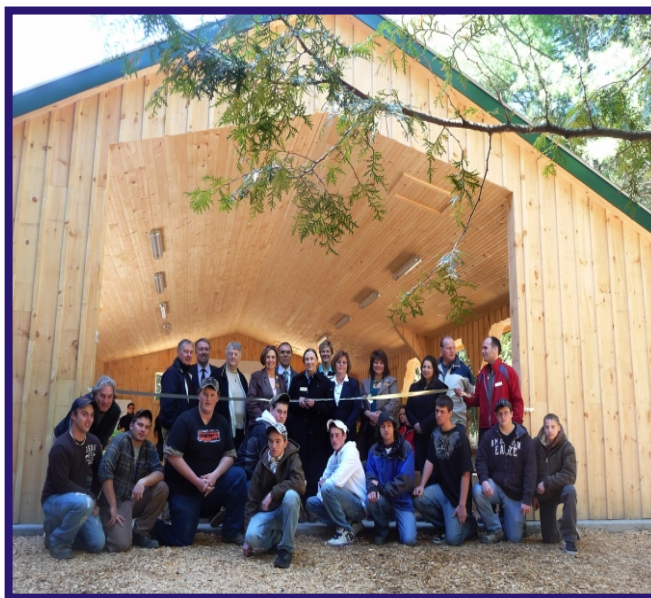
Frink Outdoor Education Pavilion... Built by the Centre Hastings Secondary School Renovation and Restoration 2011 class.

of the document can be obtained at QC's main office or at http://www.quinteconservation.ca . This document has more identification information for each